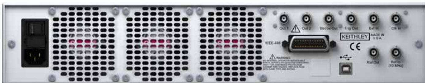
Model 3402-R, Dual-Channel with Rear Outputs